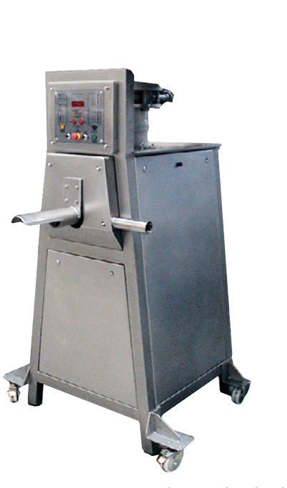
S-50 Bagging machine with valved bag head