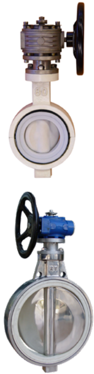
R type actuator dimensions